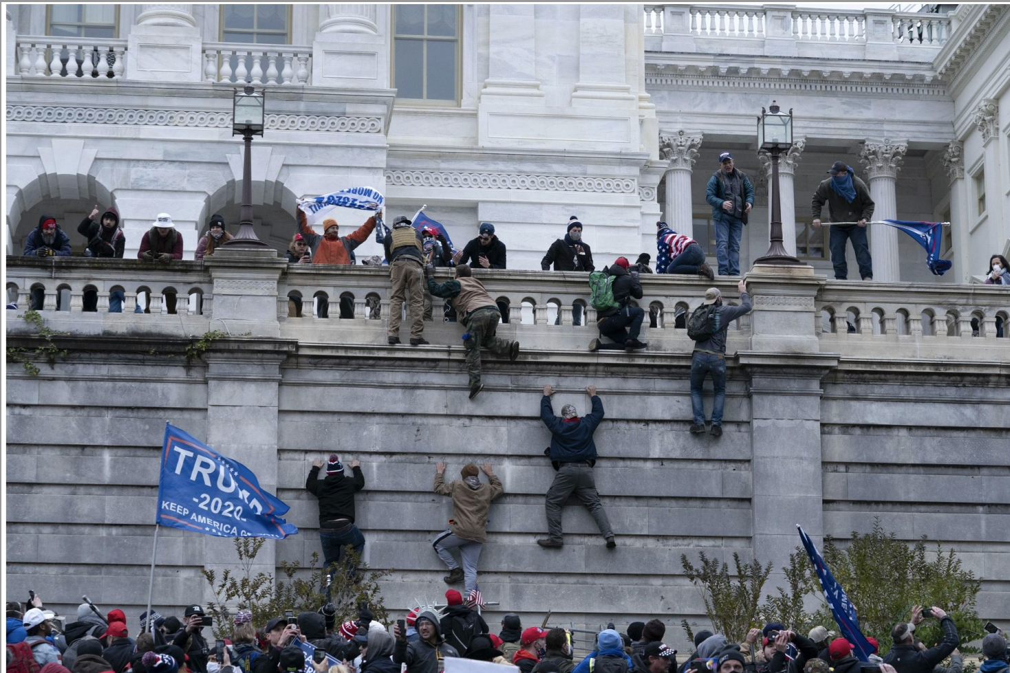
Insurrectionists climb the west wall of the Capitol on January 6, 2021.